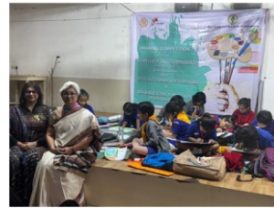
Title : Art Competition Venue : Bidyabharati Girls School, Mominpore Date : 30 Nov 2024