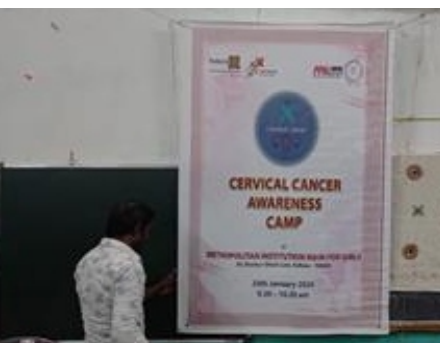
Title : Cervical Cancer Awareness Camp Venue : Metropolitan School, Kolkata Date : 25 Jan 2025 Partner : Family Planning Association of India