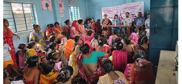
Title : Cervical Cancer Awareness Camp Venue : Bracebridge, Kolkata Date : 25 Jul 2024 Partner : Family Planning Association of India