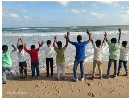
Date : 28 Sep 2024

Details : For the first time in their life, the children travelled out of their City to the beautiful state of Odisha by Vande Bharat Express in the morning, driving down to the sea-side appreciating the nature and scenic beauty surrounding the road to the beach town of Puri, be housed in a spacious heritage bungalow, being treated over sumptuous meal with no limit over the portions, indulging in the sea that they have seen for the first time, and last but not the least, by travelling back to Kolkata on an Indigo flight, a definite first time for them. Rotary Bhubaneswar had hosted us at Rotary Bhavan in Bhubaneswar and Rotary Puri in Puri.