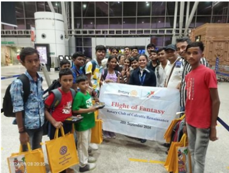
Title : Flight of Fantasy