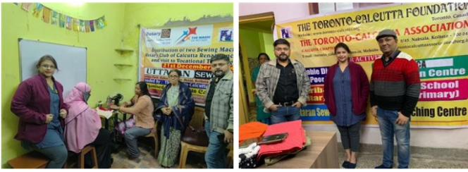
Title : Sewing Machine Distribution Venue : Boral, Garia Date : 21 Dec 2024 Details : Distribution of Sewing machines to Uttaran Sewing School run by Toronto Calcutta Association